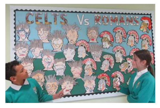
Pupils admire our creative displays