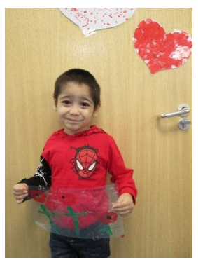
Here are our finished pictures – we used a cut-up apple to make the poppy shape.