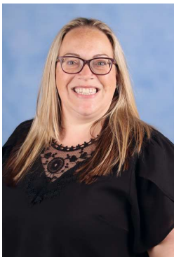
Miss Beaumont English Lead