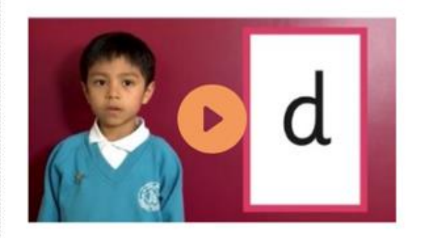
Phase 2 sounds taught in Reception Autumn 1